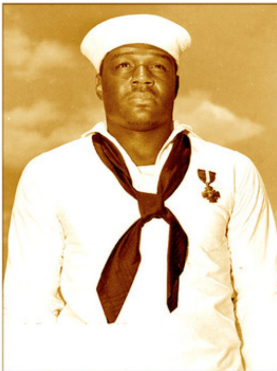
Ship's Cook Third Class Doris Miller, USN

Because of his physical prowess, he was assigned to carry wounded fellow Sailors to places of greater safety. Then an officer ordered him to the bridge to aid the mortally wounded Captain of the ship. He subsequently manned a 50 caliber Browning anti-aircraft machine gun until he ran out of ammunition and was ordered to abandon ship.